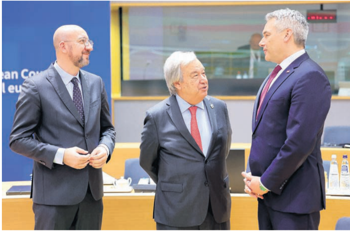
United Nations Secretary General Antonio Guterres, center, speaks with European Council President Charles Michel, left, and Austria's Chancellor Karl Nehammer during a round table meeting at an EU Summit in Brussels, Thursday, March 21, 2024.

A U.N. food agency has warned that "famine is imminent" in northern Gaza. Israel, meanwhile, appears